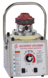
Transport Handle Style