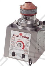
Transport Screws Style

Sample Photo / Actual Cotton Candy Machine Style May Vary.